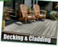
Decking & Cladding